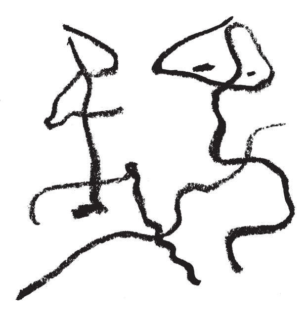
Drawing from a choreographic workshop

standing. Choices of words and categories determine the dimensions of experiential meanings and relations. Philosopher Ole Fogh Kirkeby's descriptions of lived space are illustrative (Kirkeby 1996, 18): "The cathedral in Gdansk. Floor and vault of stone....The space of sound. The space of sight. The self-incarceration of the body: the joy: everything is being-it ... The bell creates the space. Touches the leaves in the distant forest with the light beams from its body of the sun bronze"23. The rhythm and feeling of the language resonates with the experience of lived space - bodily, magically and multidimensionally. We use the example to demonstrate that poetic language contains dimensions of meaning that cannot be expressed in a merely analytical, conceptual language. Such qualitative nuances are not merely superfluous coating or stylistic play; they are of crucial importance for both the lived experience