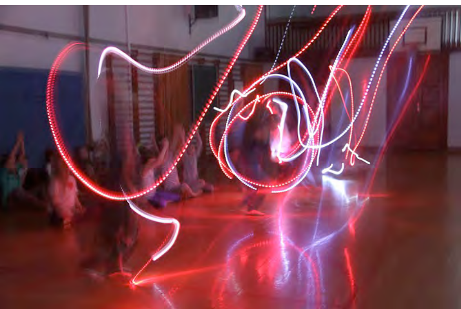
The students dancing with lights in the dark gym ball.

When I work with dance I often work with the word intensity. How can I be so sure that intensity is present? Intensity can be complex to measure or label but it is a very clear feeling. In a teaching situation, I certainly feel the intensity level in my body; I feel a high concentration level in the room and a positive constructive energy. When I feel that the