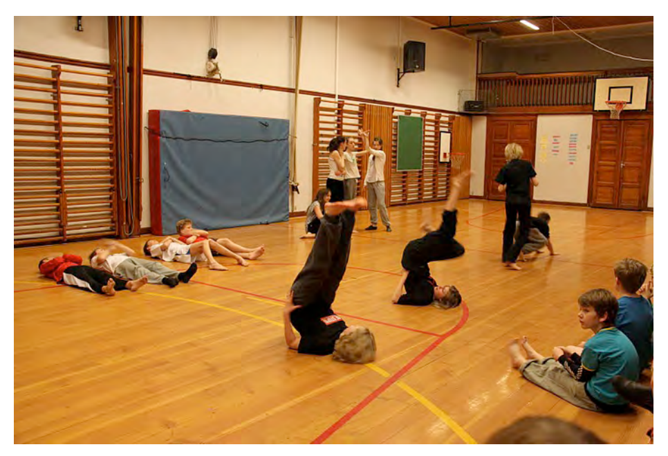
Class 7b performing their inside/outside dance.