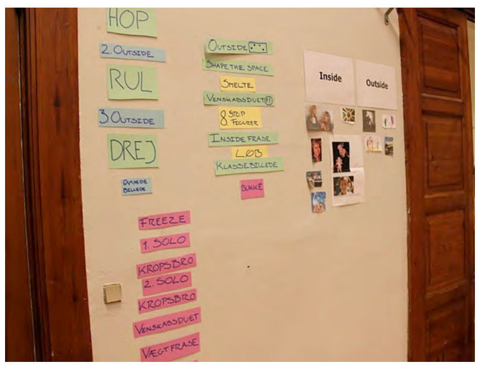
One of the walls in the gym hall.